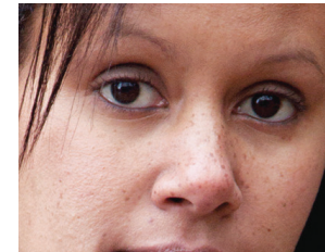
My neighbours play loud music at all hours