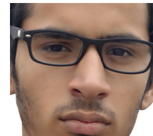
I feel intimidated by street drinkers