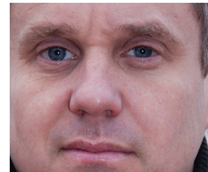
My windows get smashed