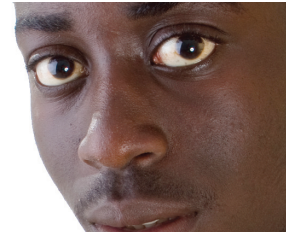
I get graffiti on my wall